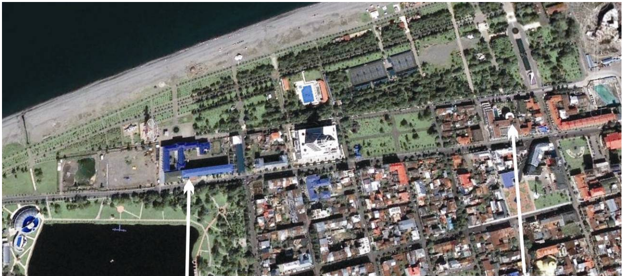
Shota Rustaveli State University